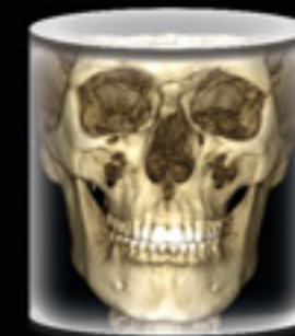
Planmeca Viso™ G5

Our Planmeca Viso™ CBCT imaging unit family now consists of two models – both offering exceptional image quality, numerous cutting-edge features, and premium usability. The units are capable of three-dimensional imaging, as well as panoramic, extraoral bitewing, and cephalometric imaging.