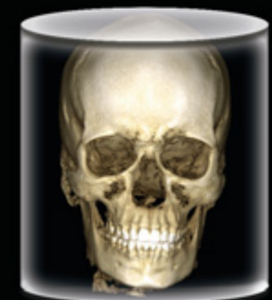
Planmeca Viso™ G7

Maximum volume without stitching: Ø200 x 100 mm Maximum volume with vertical stitching: Ø200 x 170 mm