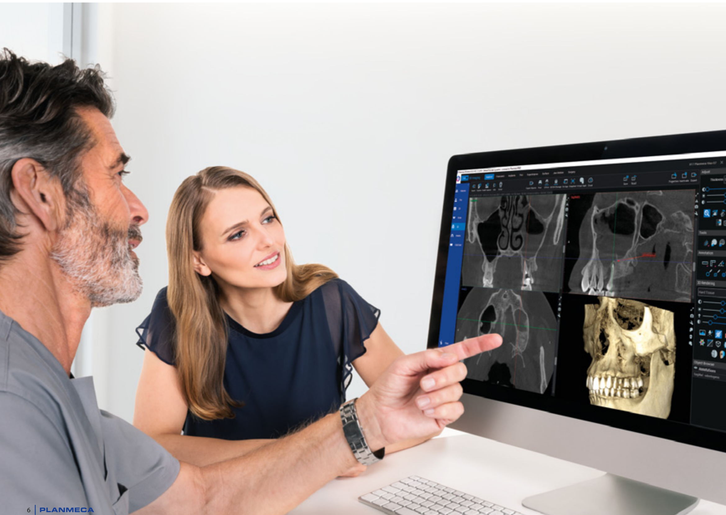
Image quality is among the most important factors in CBCT imaging. Planmeca Viso™ units shine in this area, as they allow you to capture crystal-clear images in all situations. Options for ultra low dose imaging, patient movement correction, noise removal, and metal artefact reduction are available as standard features.